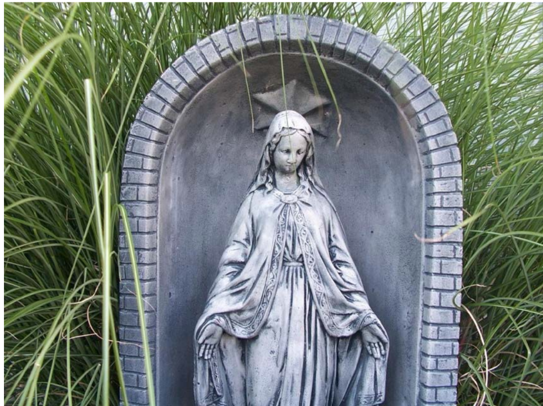
'Our Lady Star of the Sea'